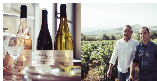
The Romy trilogy